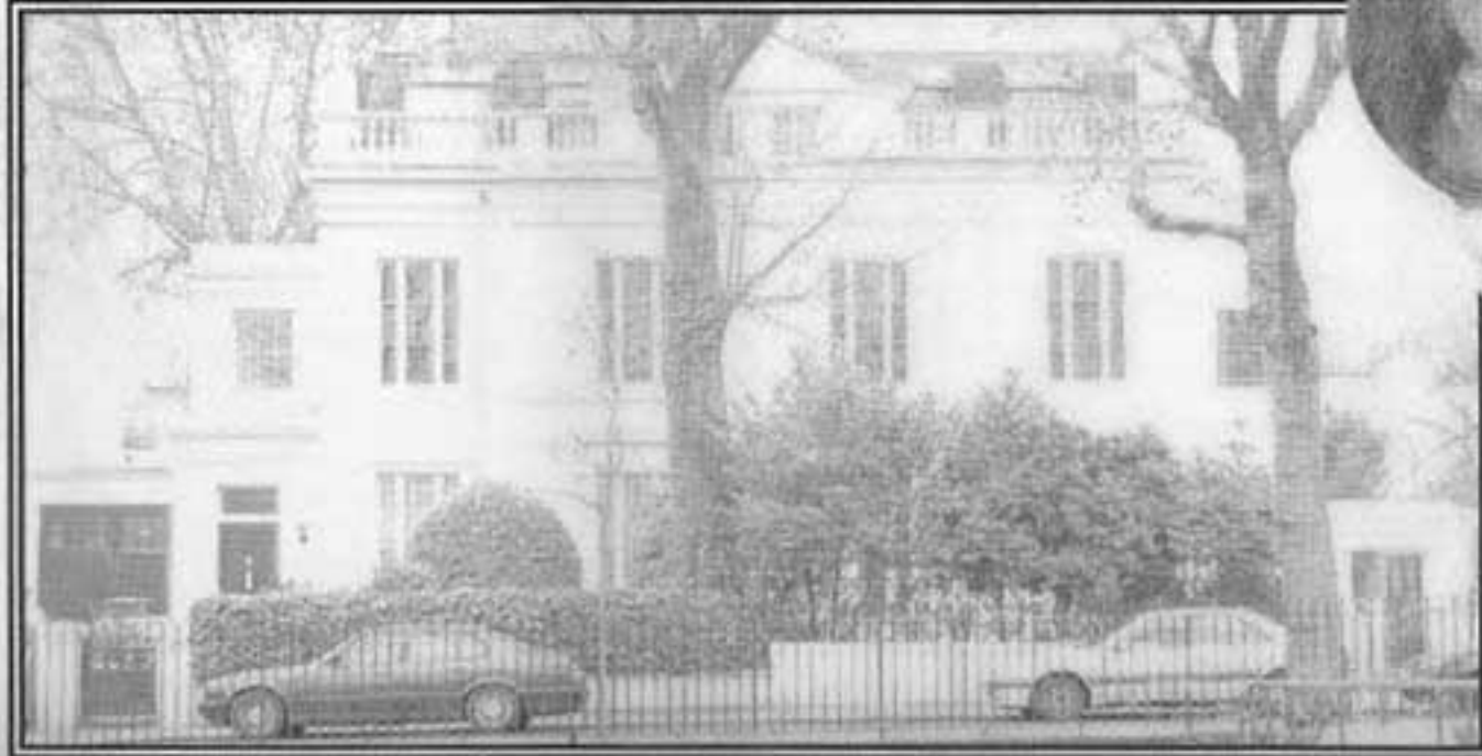
The mansion: Bought for £300,000, Gilmour sold it for more than ten times as much