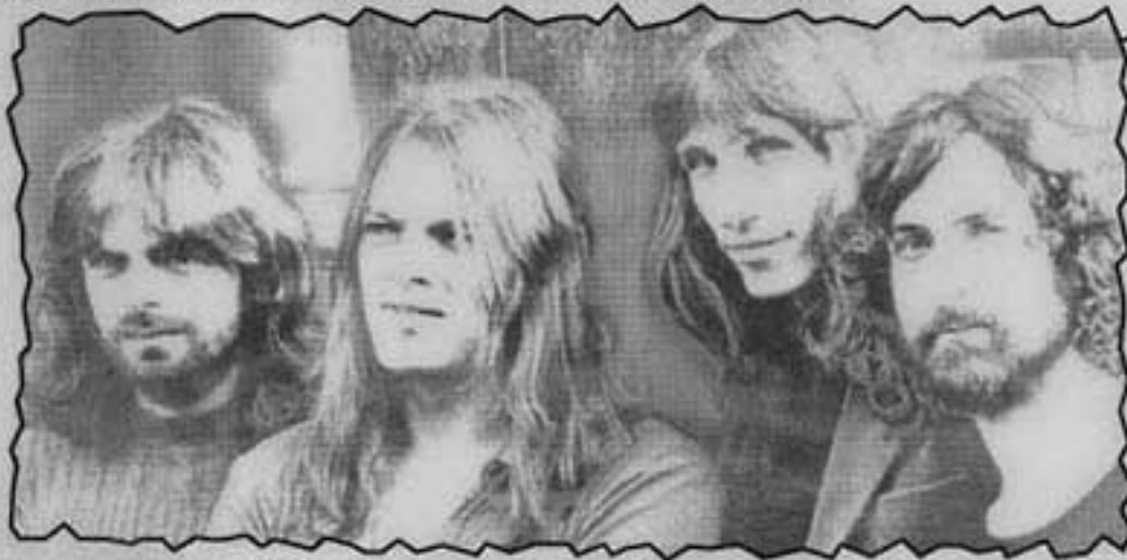
The rock star: Gilmour (second left) with Pink Floyd in the 70s

to finalise a site for the project, has asked 58-year-old Gilmour to whip up support from others in the music industry to help turn his dream into reality.