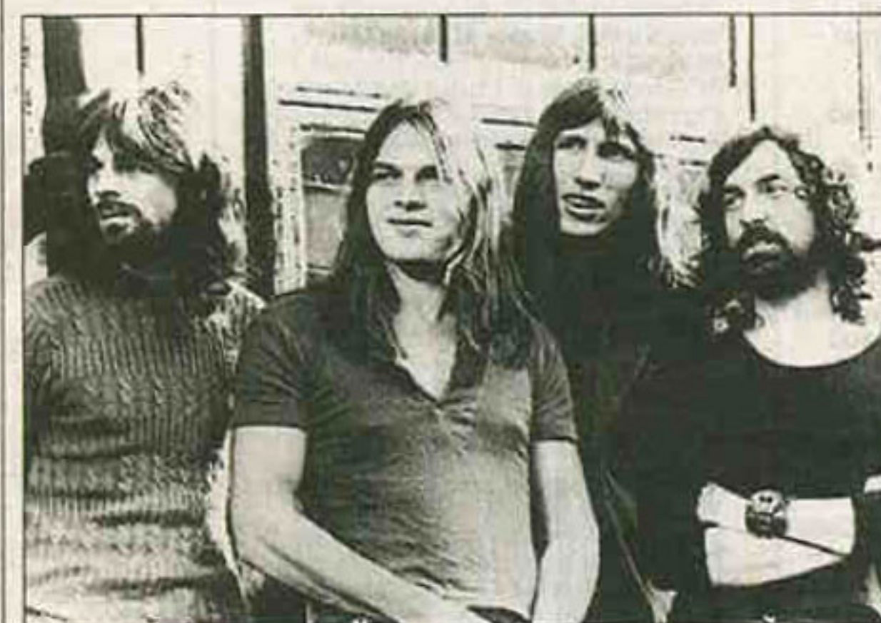
Space rock: David Gilmour during his On an Island tour. Left: Pink Floyd in the Seventies, from left, Rick Wright, David Gilmour, Roger Waters and Nick Mason

that made me cringe with embarrassment when I heard it afterwards. These days, I suppose I would be prepared to sacrifice the occasional nirvana-like few seconds to get rid of the dross, because there was a lot. I want it to be more of a joy."