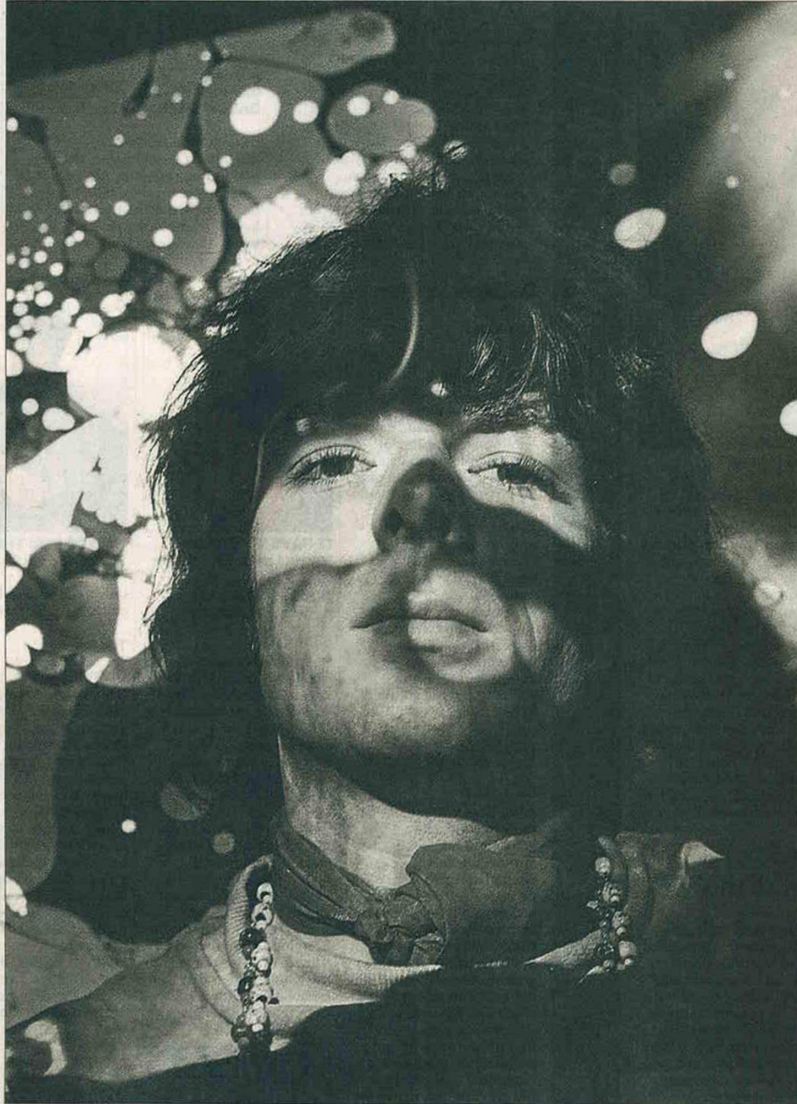
Wright: one in four British households is said to possess a copy of Dark Side of the Moon , much of which he co-wrote

But Wright's relationship with Waters had never been an easy one, and as Waters consolidated his hold over the group's musical direction tensions rose to the surface. In 1979 Waters fired Wright and allowed him to play only as a sideman during live concerts for the album The Wall . Ironically, Wright became the only