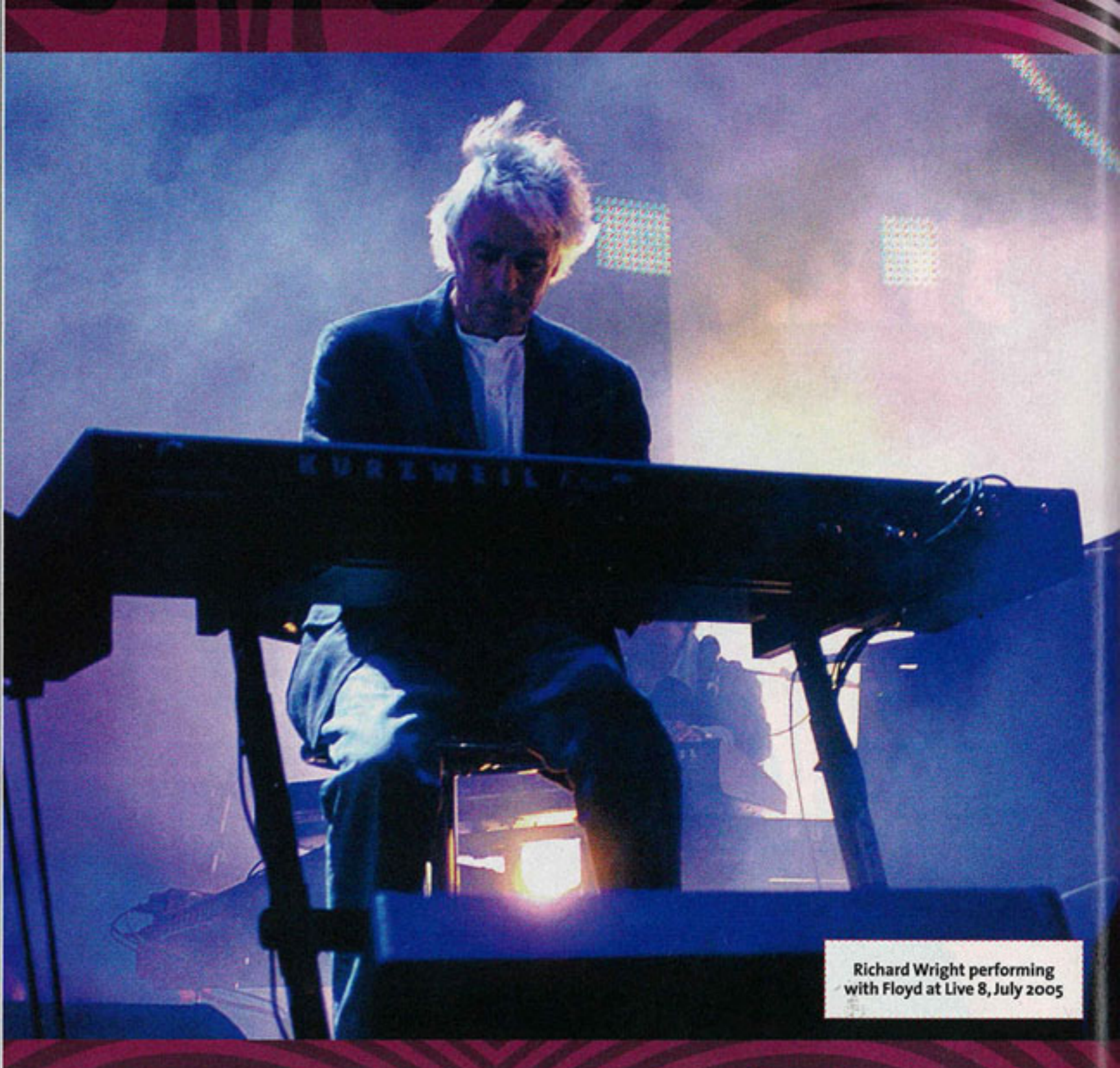
Richard Wright performing with Floyd at Live 8, July 2005

feet as an artist after all these years—or finding new feet.”