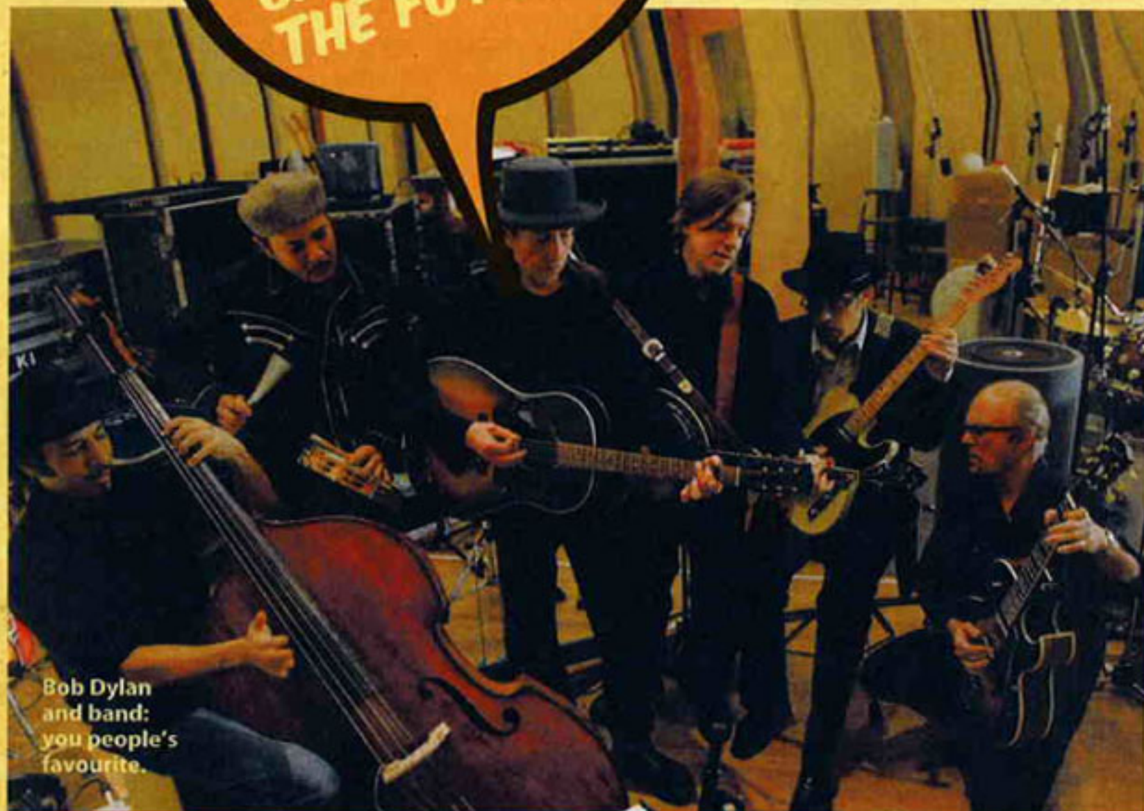
Bob Dylan and band: you people's favourite.

"IF YOU KNOW THE PAST YOU CAN CONTROL THE FUTURE!"