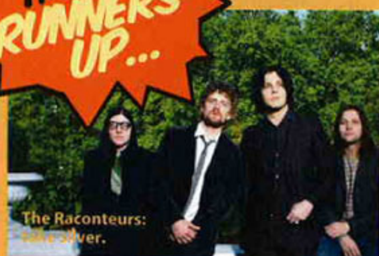
The Raconteurs: dark silver.