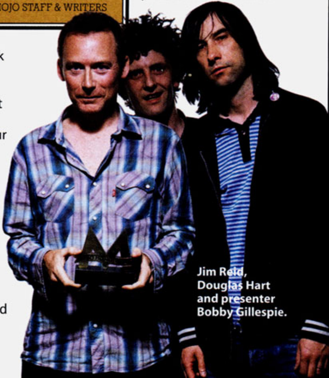
Jim Reid, Douglas Hart and presenter Bobby Gillespie.