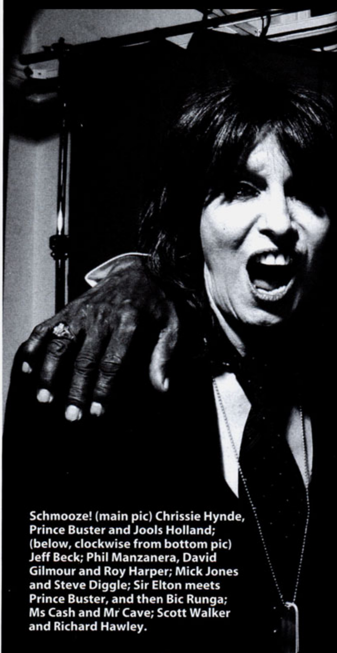
Schmooze! (main pic) Chrissie Hynde, Prince Buster and Jools Holland; (below, clockwise from bottom pic) Jeff Beck; Phil Manzanera, David Gilmour and Roy Harper; Mick Jones and Steve Diggle; Sir Elton meets Prince Buster, and then Bic Runga; Ms Cash and Mr Cave; Scott Walker and Richard Hawley.